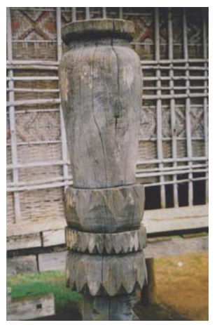
Figure 5. Jar carved on top of a pillar in front of a community house (Jarai ethnic group).

decoration, as seen in carved or painted motifs found on the communal houses of the Bahnar, Jarai, and Katu peoples (fig. 5).