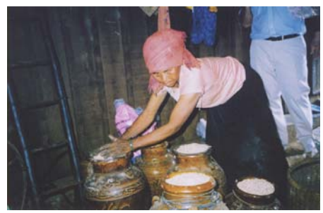
Figure 2. Making rice wine (Mnong Gar ethnic group).

The most common and significant use of jars, however, is as a container in which to make and serve traditional wine. This wine is not distilled, and people drink it directly from the jar through a long, narrow curved bamboo tube (fig. 1). Making the wine is women's work (fig. 2). The chief ingredient is rice or millet, although nowadays people also make wine from manioc. The yeast for wine is made of rice powder or certain roots and leaves. After the mixture of cooked