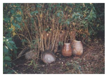
Figure 4. Jars and gongs hidden in the forest to avoid fire (Sedang ethnic group).

Believing that the spirit of the dead will live similarly in the other world as it did in this world, family members "share properties," including jars, with the spirit of the deceased. It is common to find jars in graveyards. Some are buried halfway in the earth, while others are broken off at the base or mouth because jars for the dead must be different from those for living people. In addition, broken jars will not be stolen. Among some ethnic groups, such as the Êde, people make wooden carvings in the shape of jars and attach them to the poles of the offering shelves used during rituals. These jars are also dedicated to the dead. Images of jars are also used for