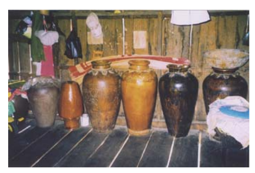
Figure 3. Custom of placing jars along the house wall (Êde Kpa ethnic group).

Because of this custom of holding jars in high esteem, which is shared by most peoples in the Central Highlands, the jar is among the types of property to be shown off to the community. In the house, tall jars are lined up in rows along the wall (fig. 3). Small, round jars are commonly found in the southern Central Highlands, and people usually hang them in bamboo frames under the roof and above the rows of larger jars. Many jars are displayed