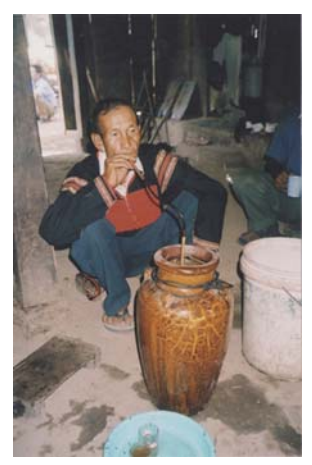
Figure 1. Drinking rice wine (Mnong Gar ethnic group).

same type of jar is named differently among different ethnic groups.